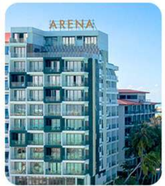
Arena Veli Sea view