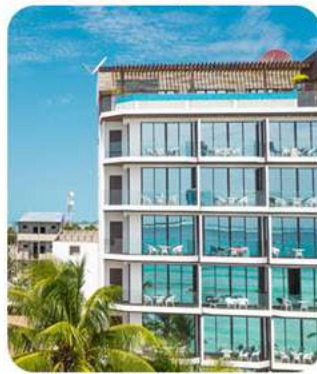
Arena Fushi Sea view