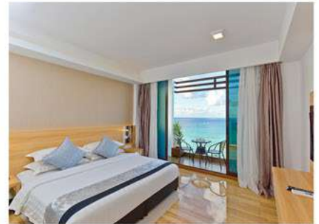
Super Deluxe Room with Balcony and Island View