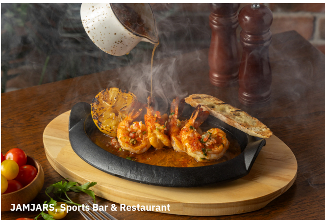
JAMJARS, Sports Bar & Restaurant